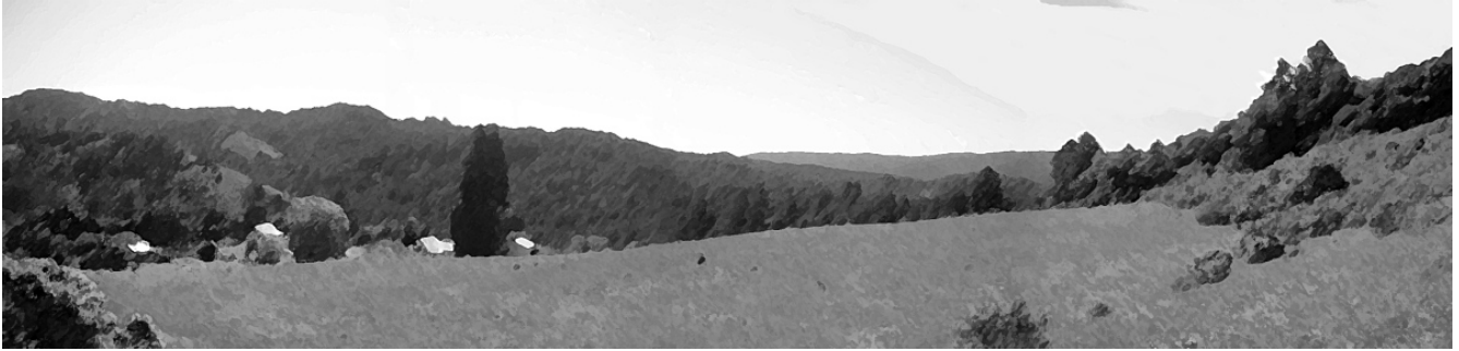
slipperworld - la honda, california photo + graphic by david elias